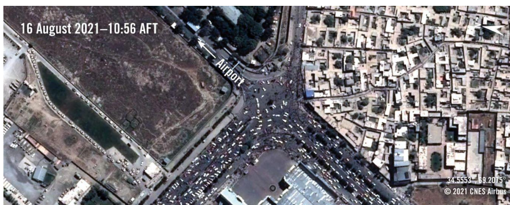
Kabul Airport vicinity. 16 August 2021.

In this report, Amnesty International, International Federation for Human Rights (FIDH) and the World Organisation against Torture (OMCT) have documented incidents of human rights violations that have taken place in Afghanistan since the takeover by the Taliban on 15 August. This report calls on the UN Human Rights Council (UNHRC) to take decisive action to establish a robust independent investigative mechanism to monitor and report on human rights abuses committed in violation of international human rights law, and to contribute to accountability for crimes under international law. Human rights defenders, journalists, and others who are targeted for their work must be evacuated and given safe passage if they wish to leave Afghanistan; and women and girls, and ethnic and religious minorities who are targeted because of their gender, ethnic, and religious identity, must be guaranteed protection. All those who wish to leave Afghanistan must be assured the right to seek asylum. At the same time, the Office of the Prosecutor of the International Criminal Court must receive assistance from the international community to immediately recommence its investigations into crimes under international law committed in Afghanistan.