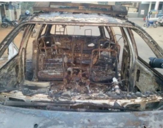
Pictures taken at the beginning of March 2018 in Belo, showing a burnt Toyota Picnic. According to evidence collected by Amnesty International, the vehicle was set ablaze by security forces manning a checkpoint at the Belo motor park on 2 February 2018.